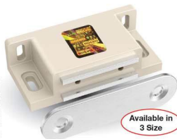
MAGNETIC DOOR CATCHER Product No. 001 / 002 / 003