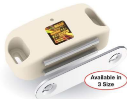
MAGNETIC DOOR CATCHER Register Design No. 207990 Product No. 918 / 927 / 936