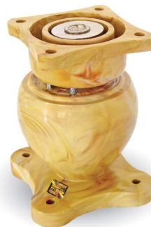
MAGNETIC DOOR HOLDER Product No. 945